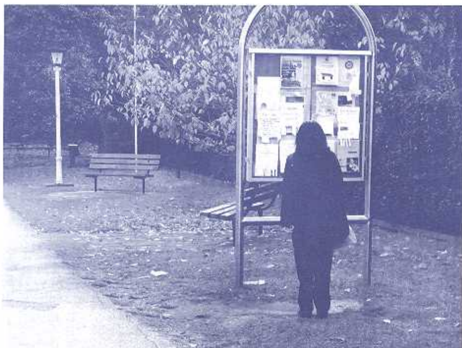
A popular facility in the Artarmon shopping centre: the community notice board by the station.