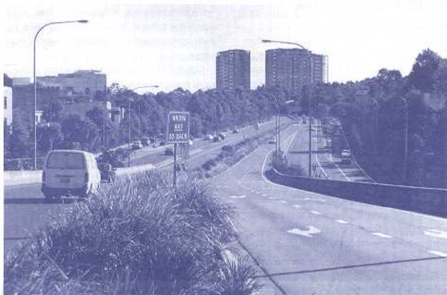
Site of the eastern entry and exit to the proposed Lane Cove Tunnel.

The focus groups follow an initial public exhibition as part of a process of gathering community input. Other focus groups have been conducted in relation to tunnel ventilation, cycling, pedestrian and public transport.